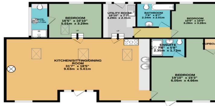
GROUND FLOOR 1343 sq.ft. (124.7 sq.m.) approx.