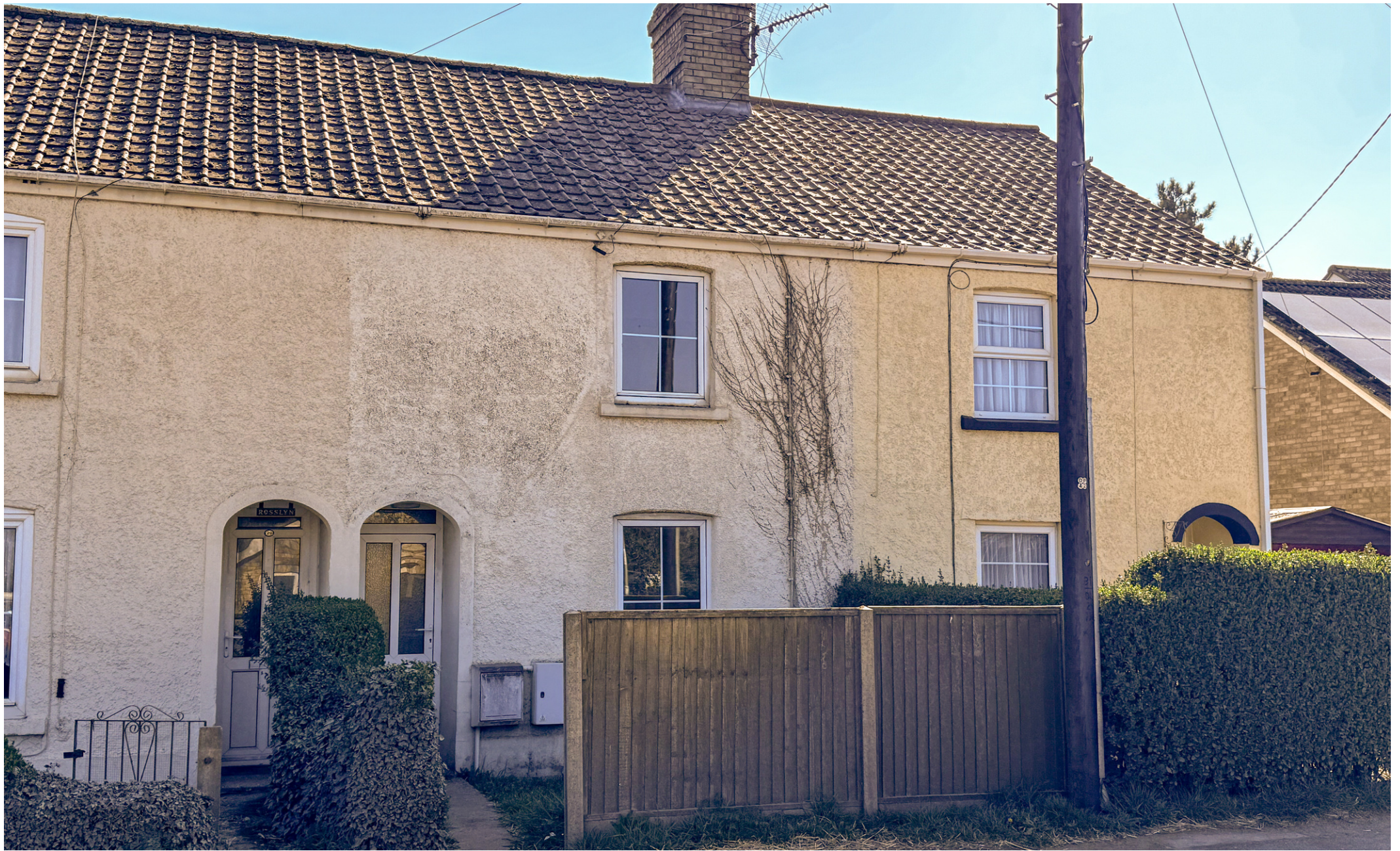
Isleham Road, Fordham, Cambridgeshire