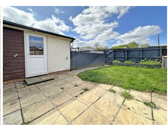
Agents Note: Whilst every care has been taken to prepare these sales particulars, they are for guidance purposes only. All measurements are approximate are for general guidance purposes only and whilst every care has been taken to ensure their accuracy, they should not be relied upon and potential buyers are advised to recheck the measurements. West of Exe is a trading name for East of Exe Ltd, Reg. no. 07121967