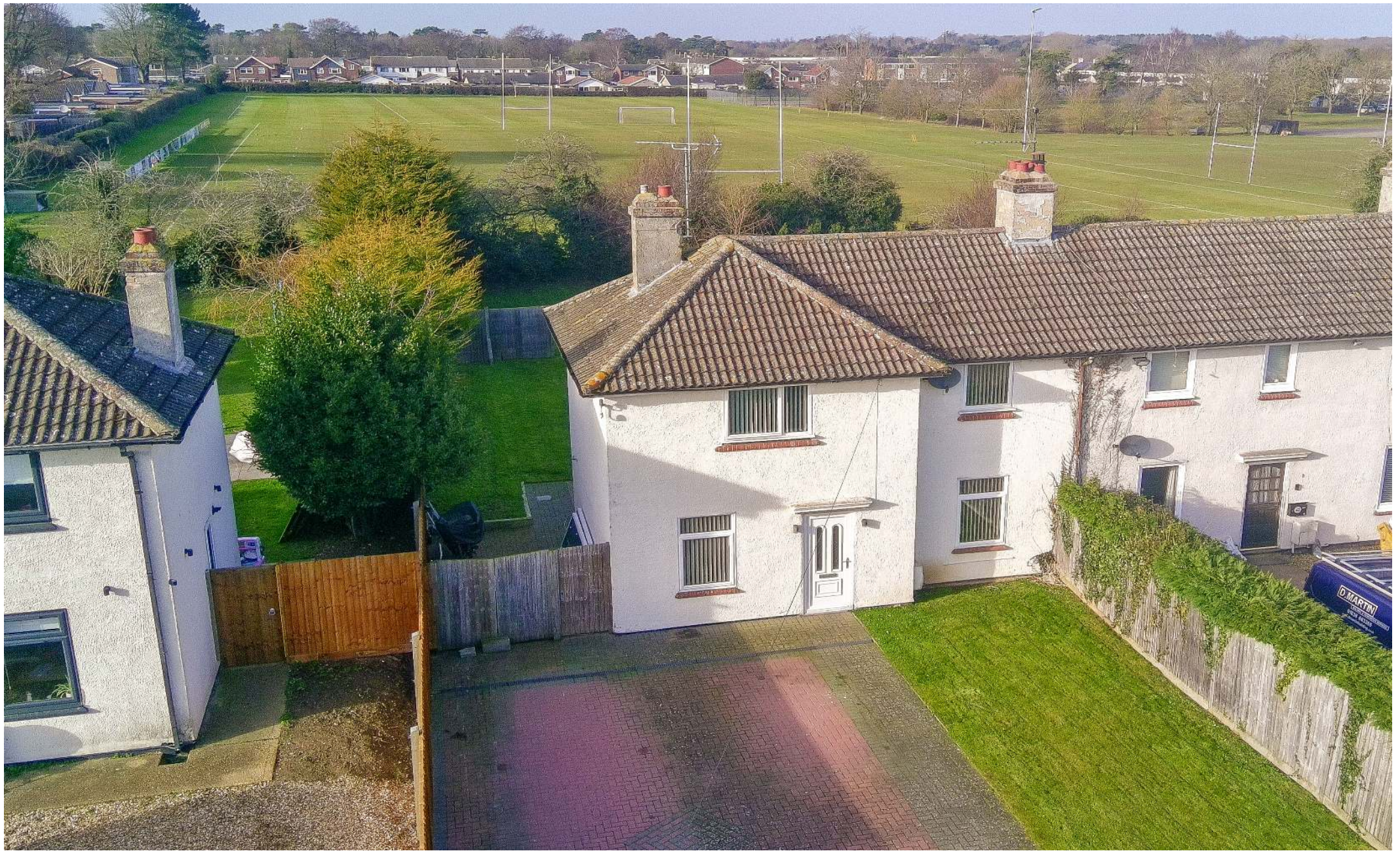
44 King Edward VII Road, Newmarket, Suffolk