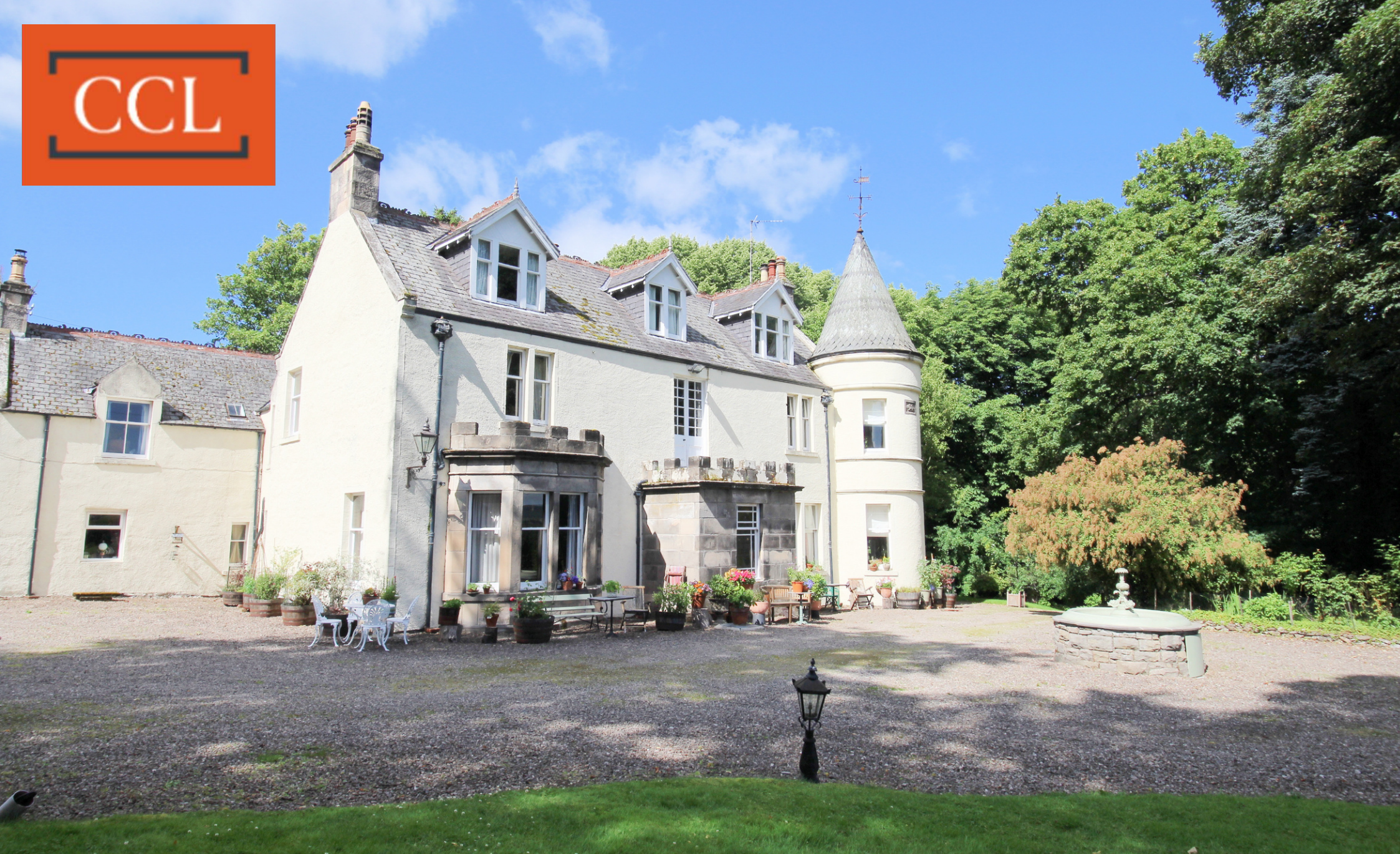
Cragganmore House, Ballindalloch, Moray