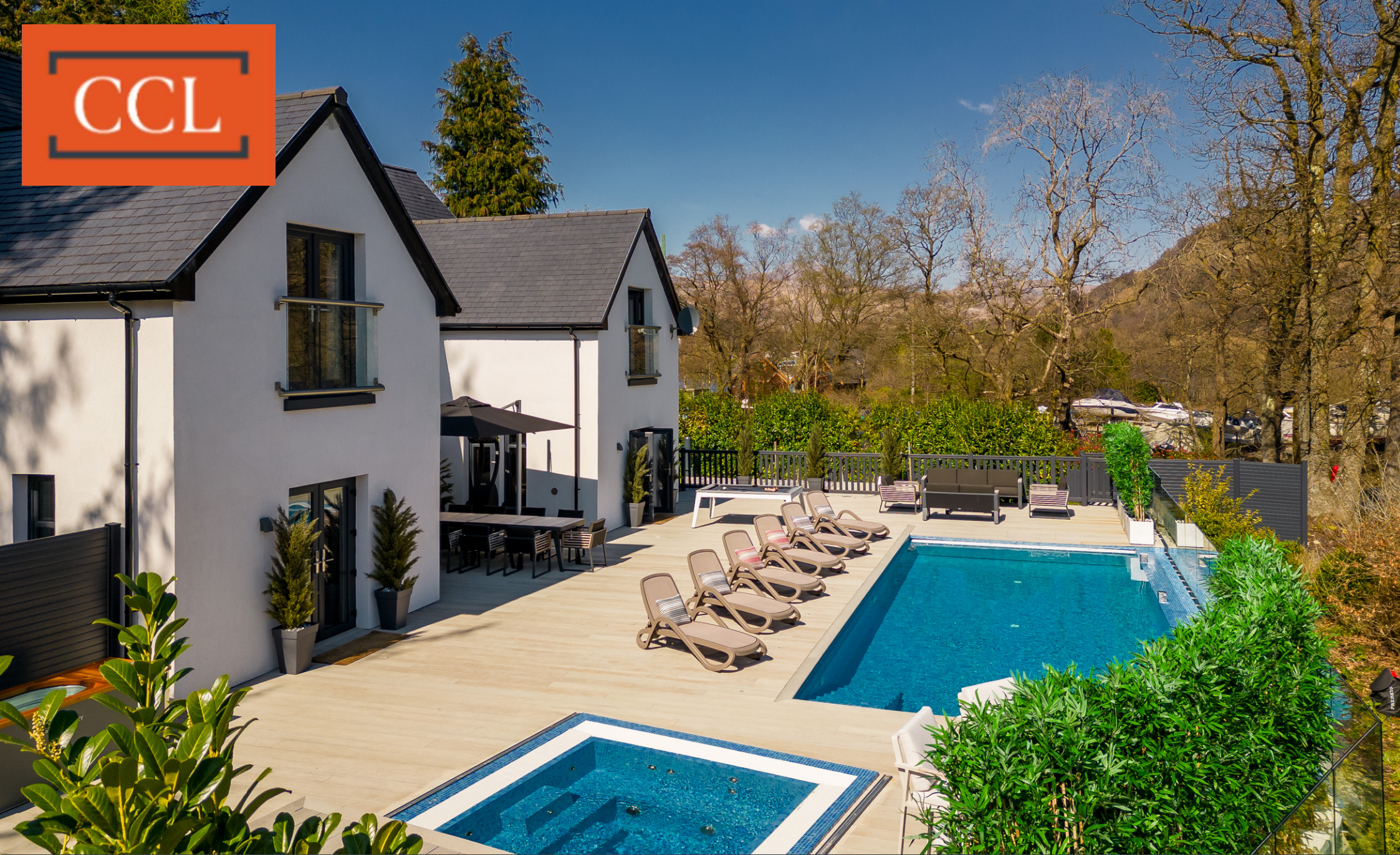
Ardlui Retreat, Arrochar, Argyll and Bute