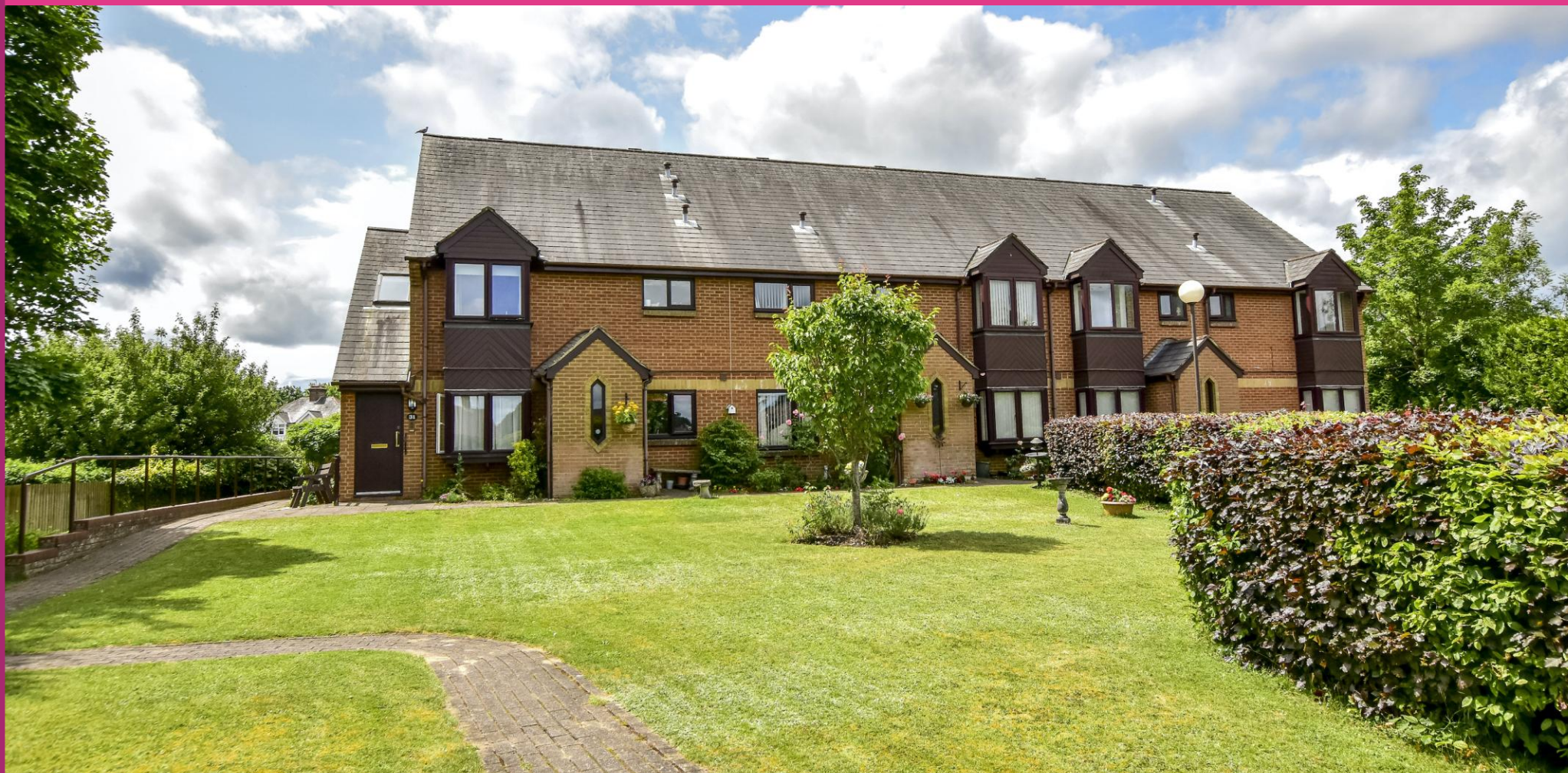
BREAKSPEAR COURT, ABBOTS LANGLEY - £290,000 2 Bedroom Retirement Home