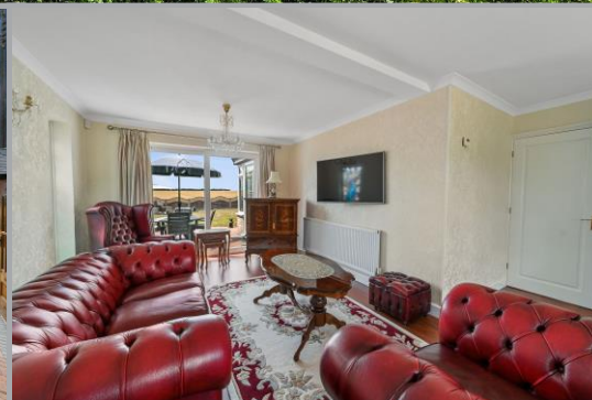
Borley Lodge | Borley Green | Woolpit | IP30 9RW

Specialist marketing for | Barns | Cottages | Period Properties | Executive Homes | Town Houses | Village Homes