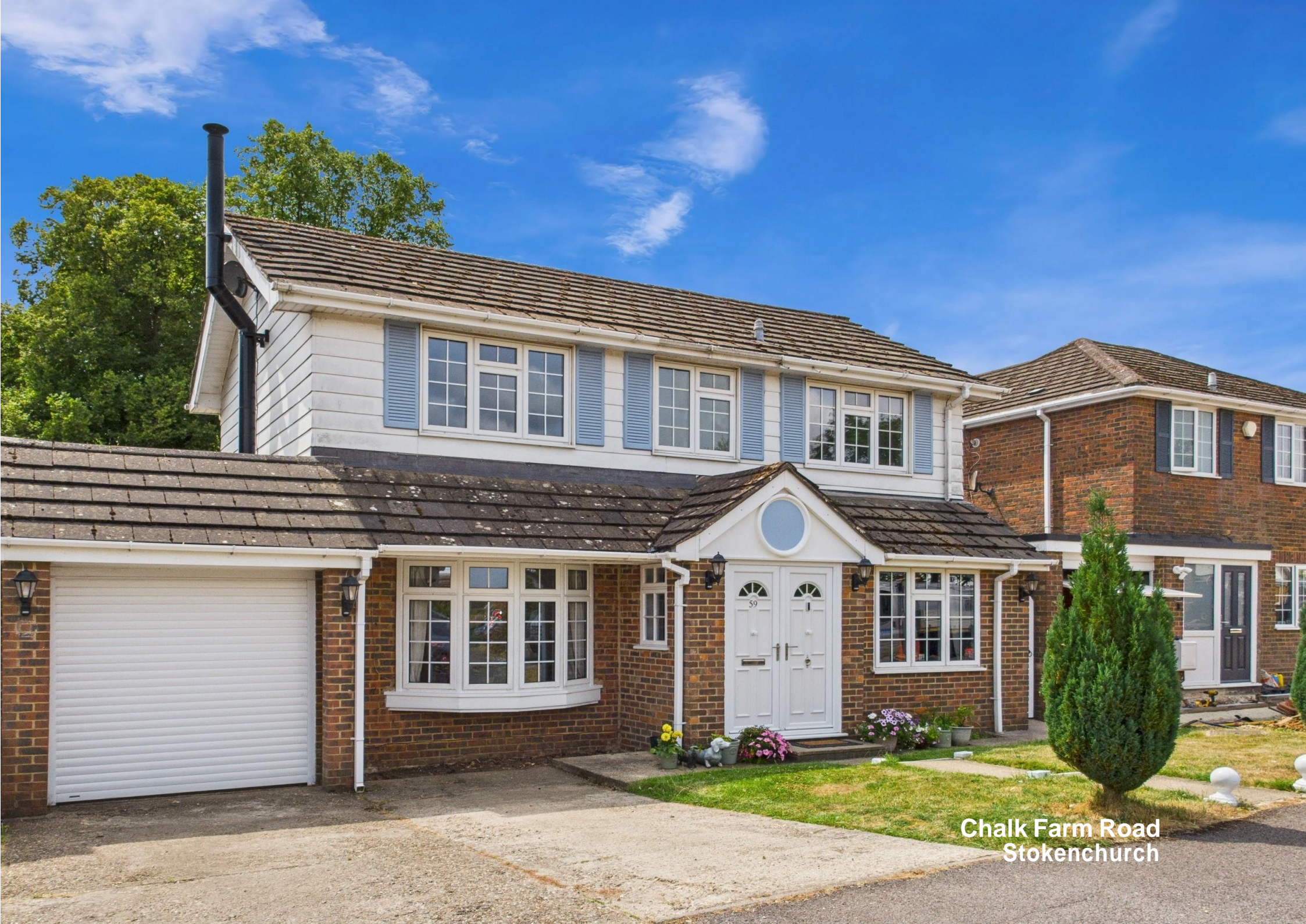
Chalk Farm Road Stokenchurch