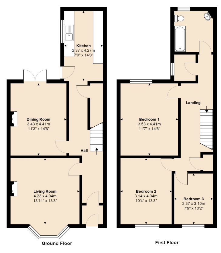
Total\ Area:\ 119.7\ m^2\ ...\ 1289\ ft^2 All measurements are approximate and for display purposes only

IMPORTANT NOTE TO PURCHASERS: We endeavour to make our sales particulars accurate and reliable, however, they do not constitute or form part of an offer or any contract and none is to be relied upon as statements of representation or fact. The services, systems and appliances listed in this specification have not been tested by us and no guarantee as to their operating ability or efficiency is given. All measurements have been taken as guide to prospective buyers only, and are not precise. Floor plans where included are not to scale and accuracy is not guaranteed. If you require clarification or further information on any points, please contact us, especially if you are travelling some distance to view. Fixtures and fittings other than those mentioned are to be agreed with the seller.