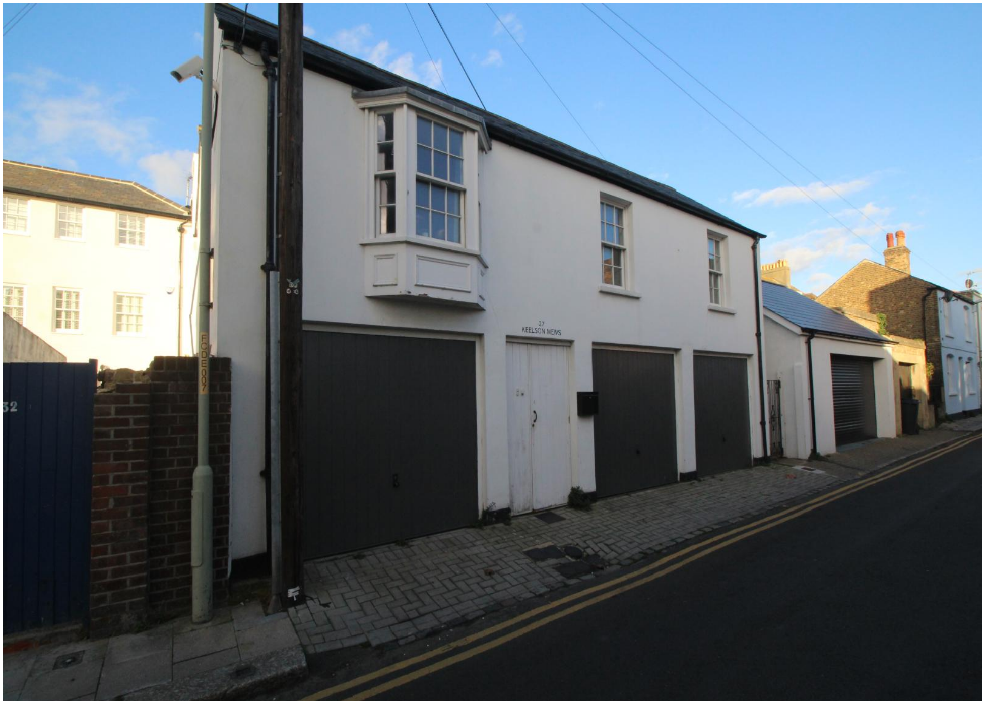
Keelson Mews, Charles Street, Herne Bay, Kent £195,000