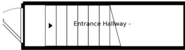
Ground Floor Floor Size: 4.4 m 2 , 47.4 ft 2