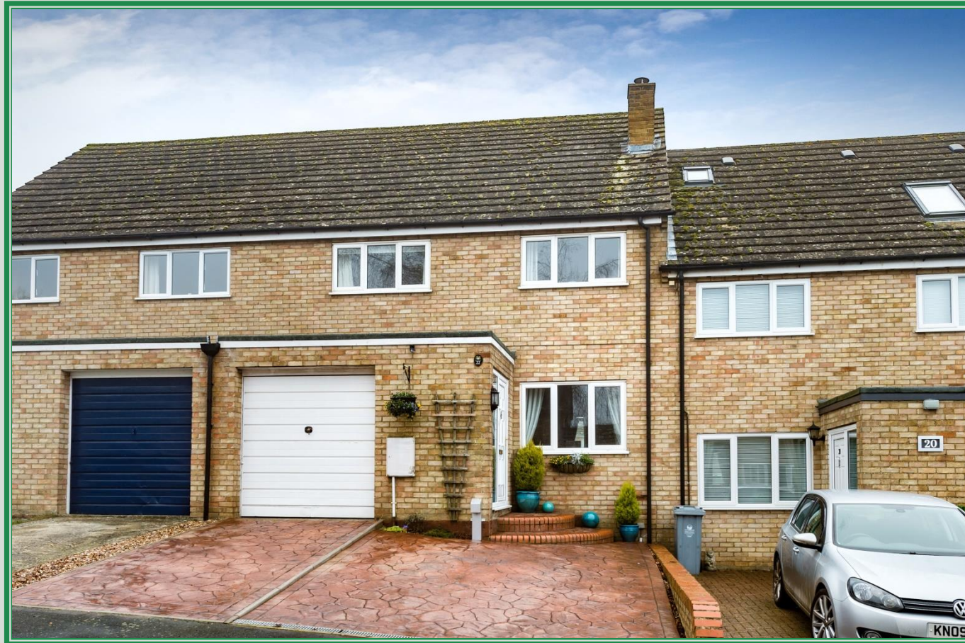
The Bartons Oxfordshire