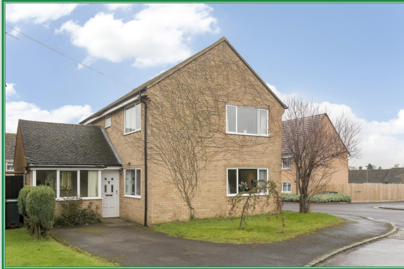
Middle Barton Oxfordshire