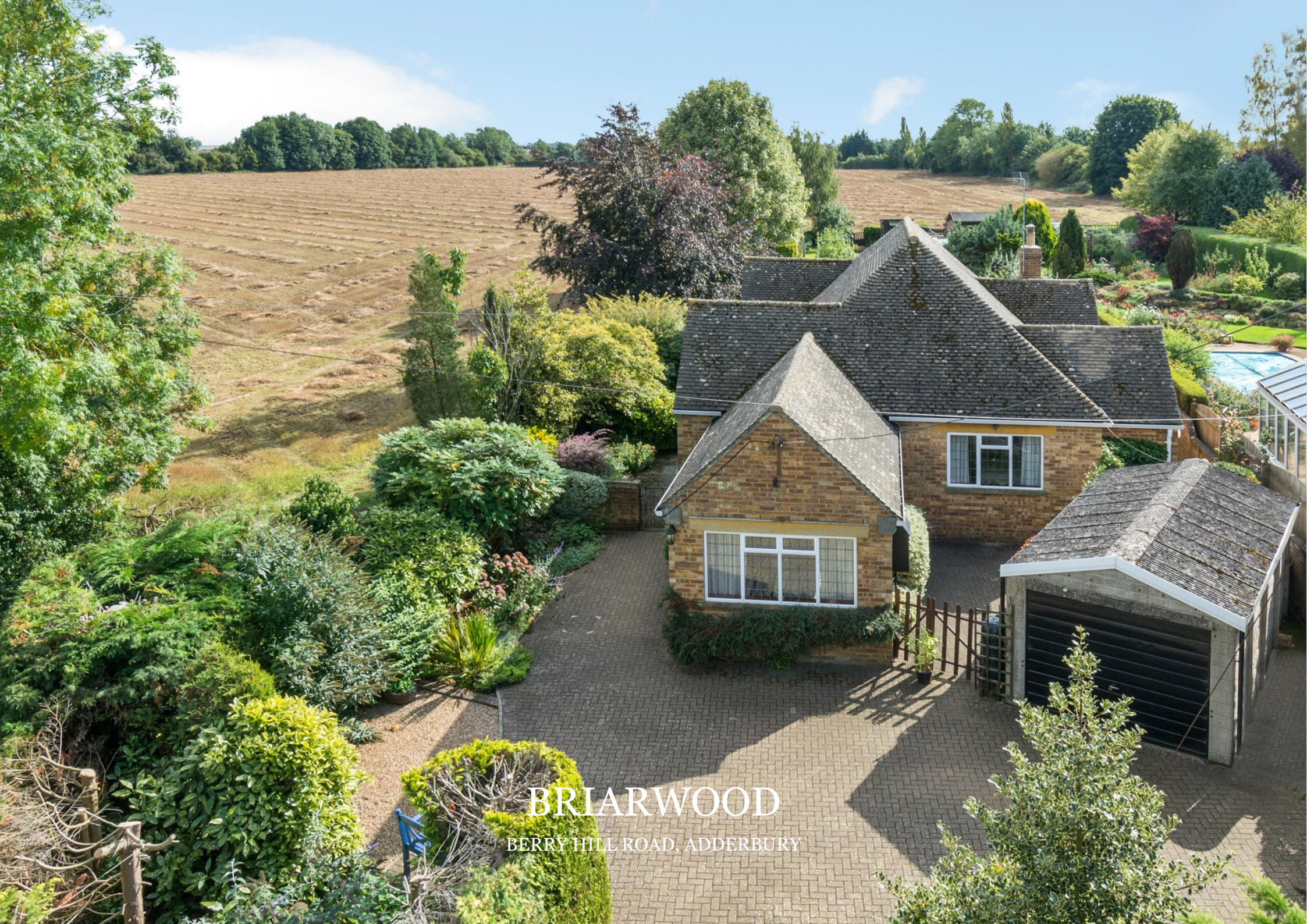
BRIARWOOD BERRY HILL ROAD, ADDERBURY