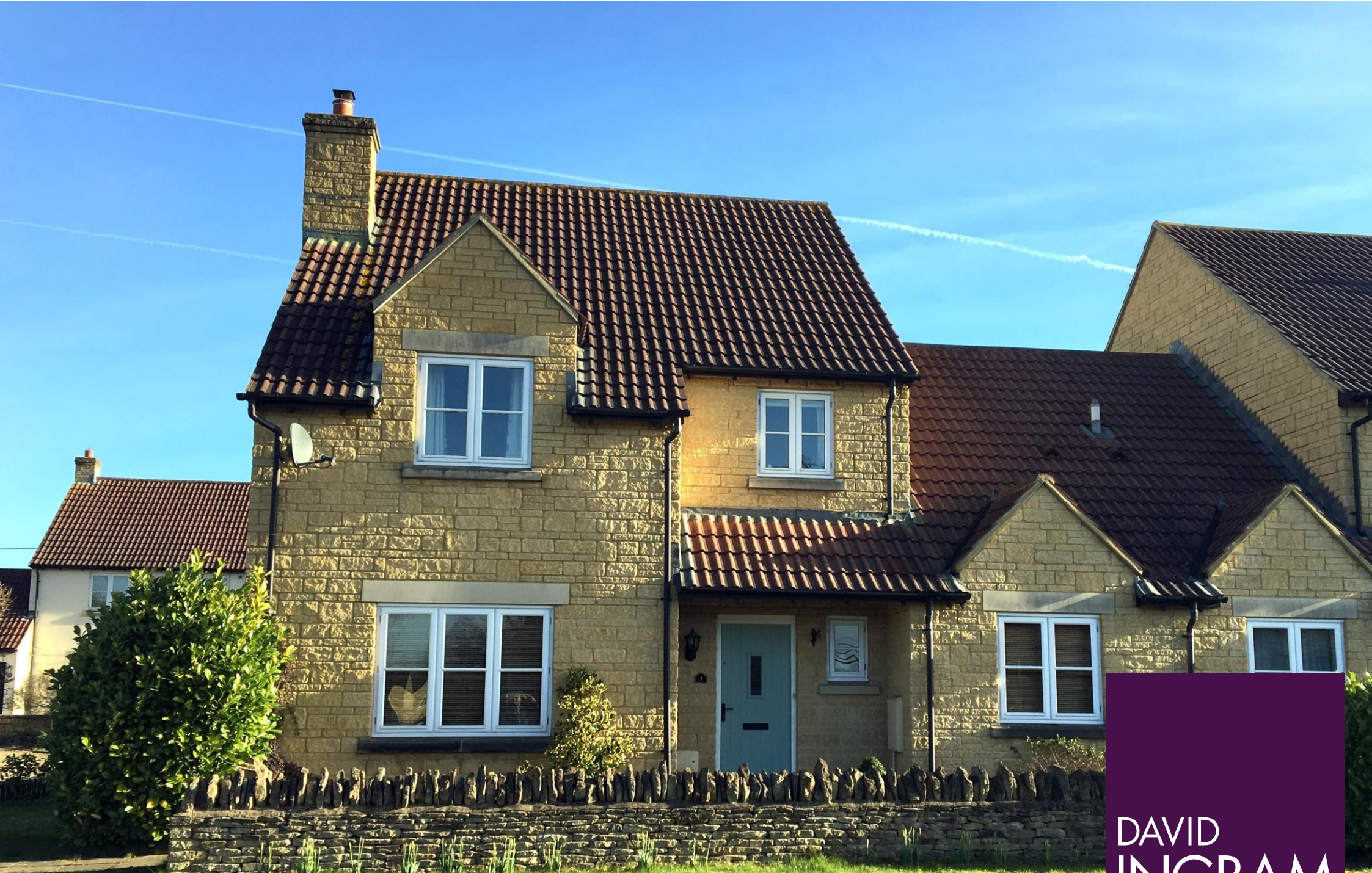
3 Beltane Place, Shaw Hill, Melksham, SN12 8LE