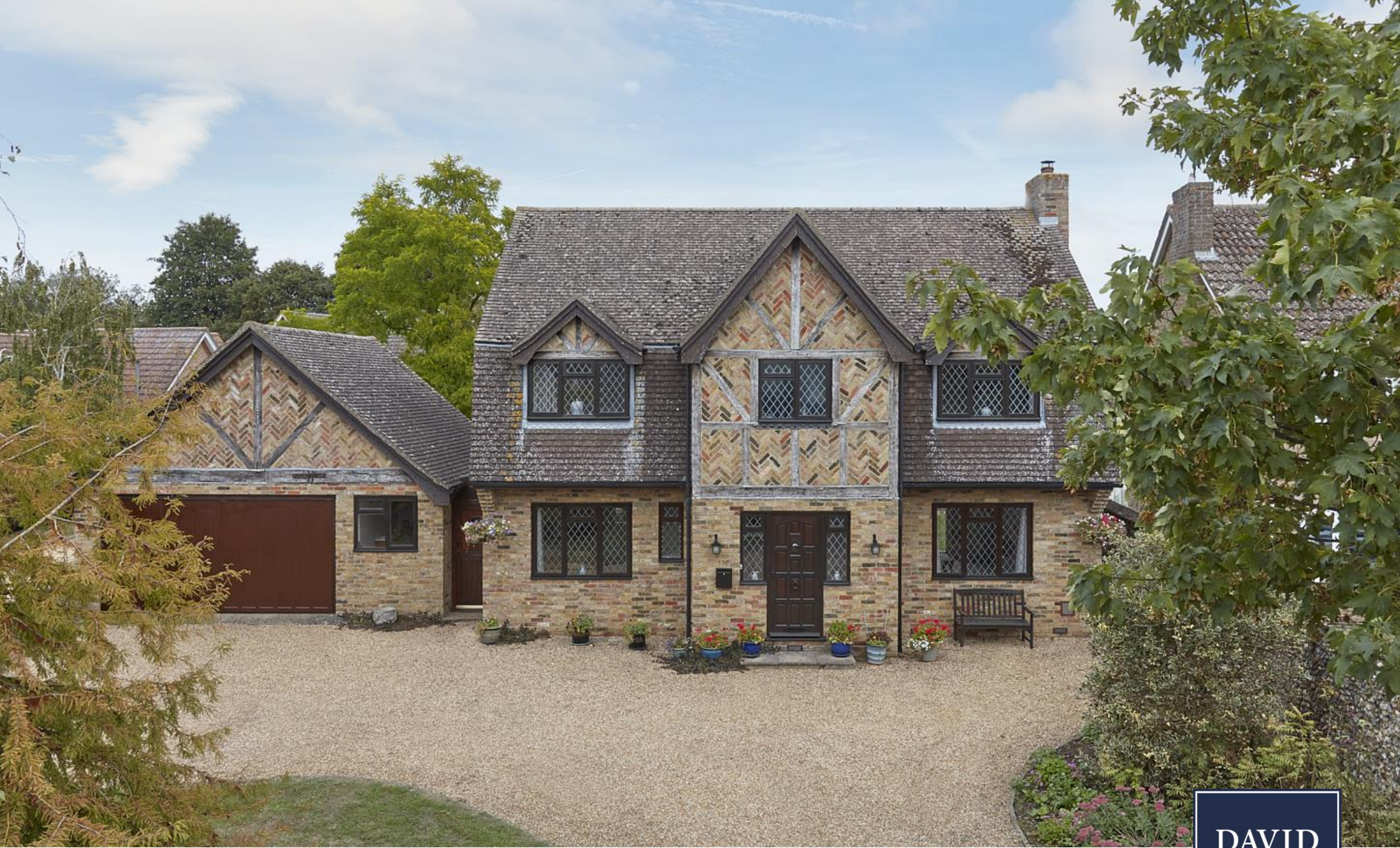
Redwood House 136 Carter Street, Fordham