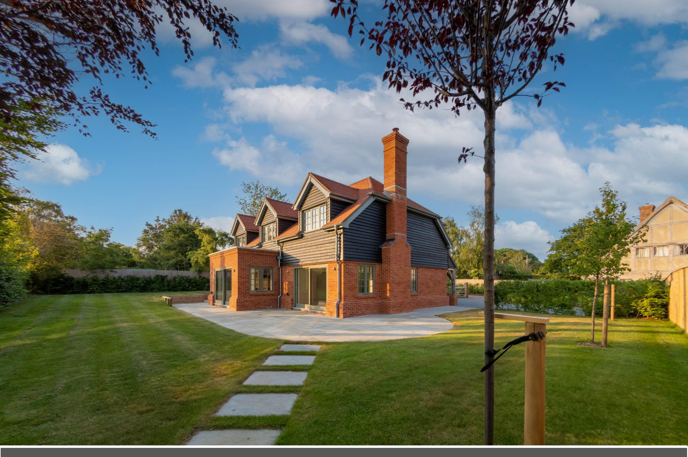
Hawthorn House, Sunnyway, Old Bosham, Chichester, PO18 8HQ