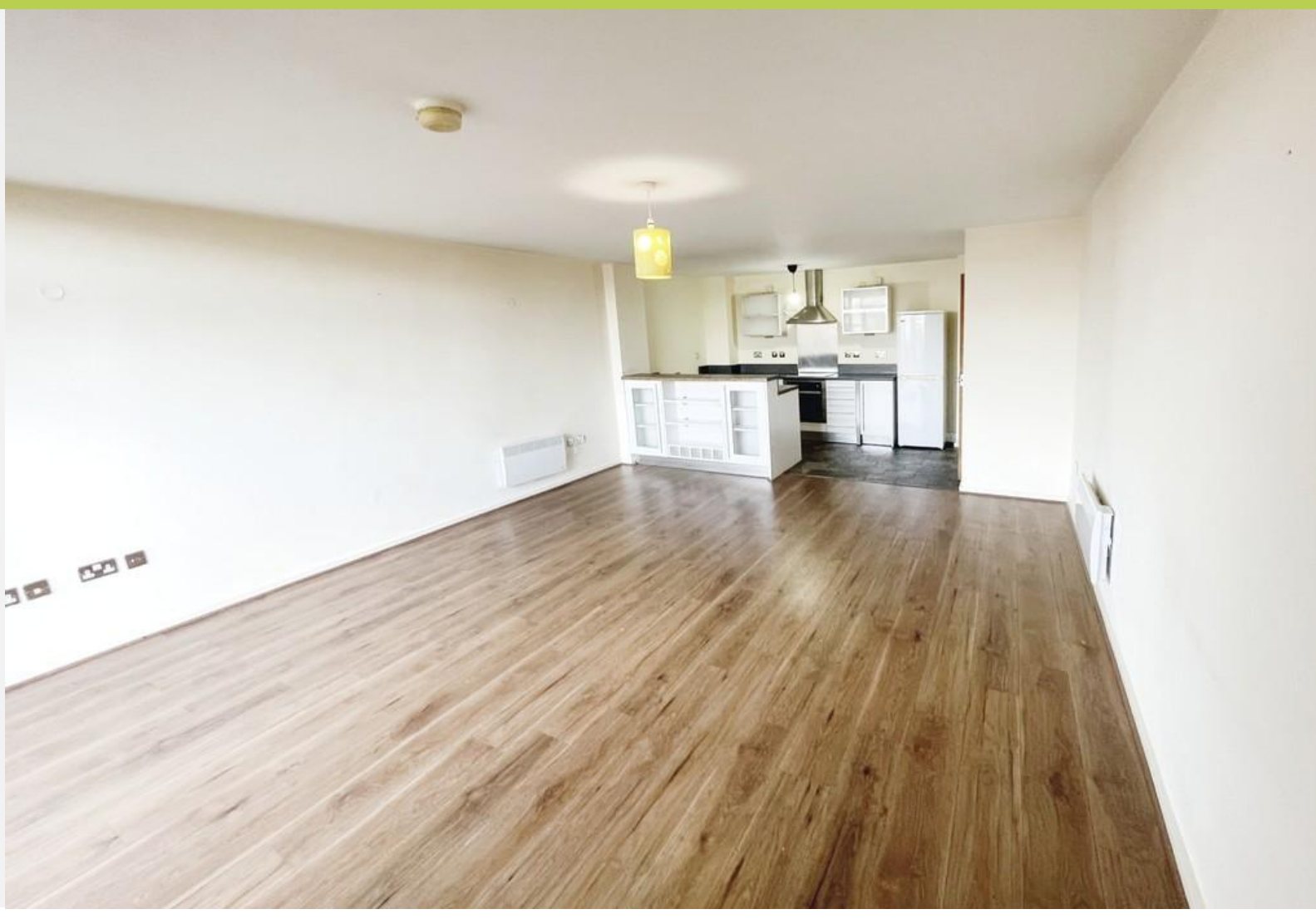
City Gate I, Blantyre Street, Manchester