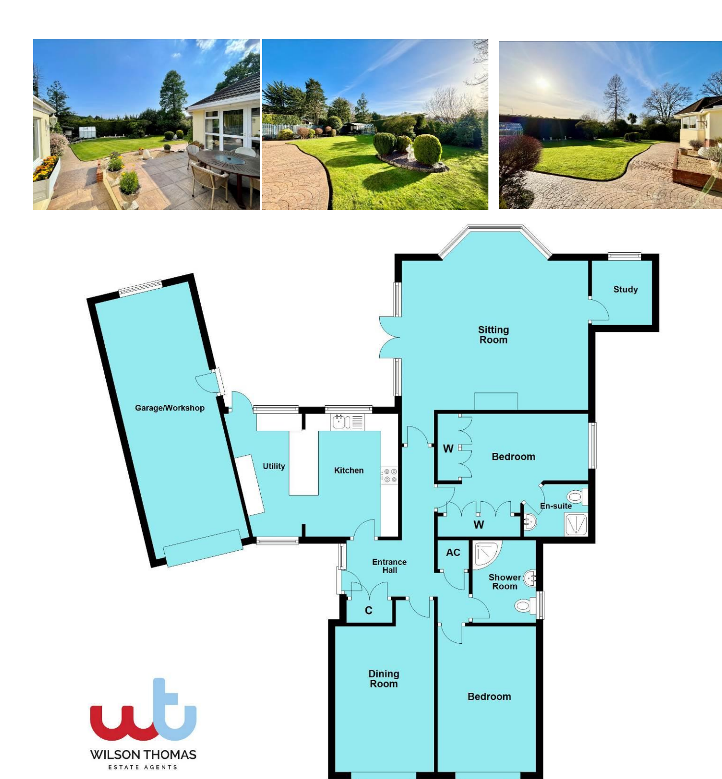
Total area: approx. 125.4 sq. metres (1349.6 sq. feet)

Whilst every attempt has been made to ensure the accuracy of the floor plan, measurements of doors, Windows, rooms and any other items are approximate and no responsibility is taken for error Omission or misstatement. This plan is for illustrative purposes only and should be used as such by any prospective purchaser. The services systems and appliances shown have not been tested and no guarantee as to their Operability or efficiency can be given Plan produced using PlanIDp.