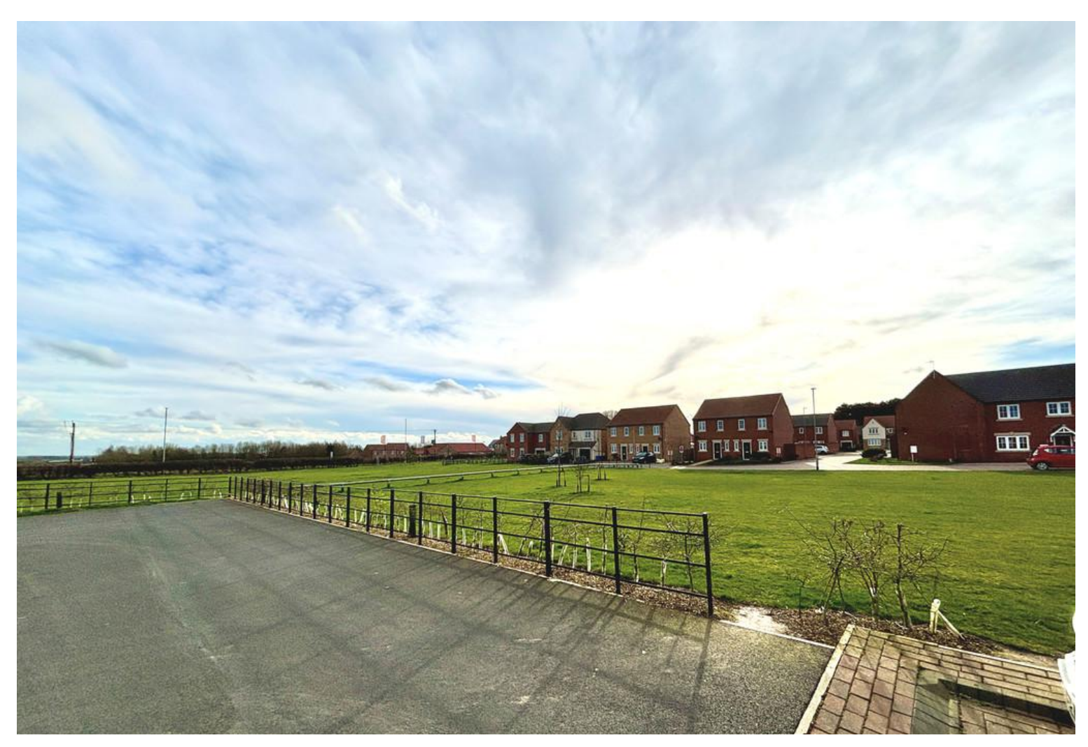
Developments Green Space