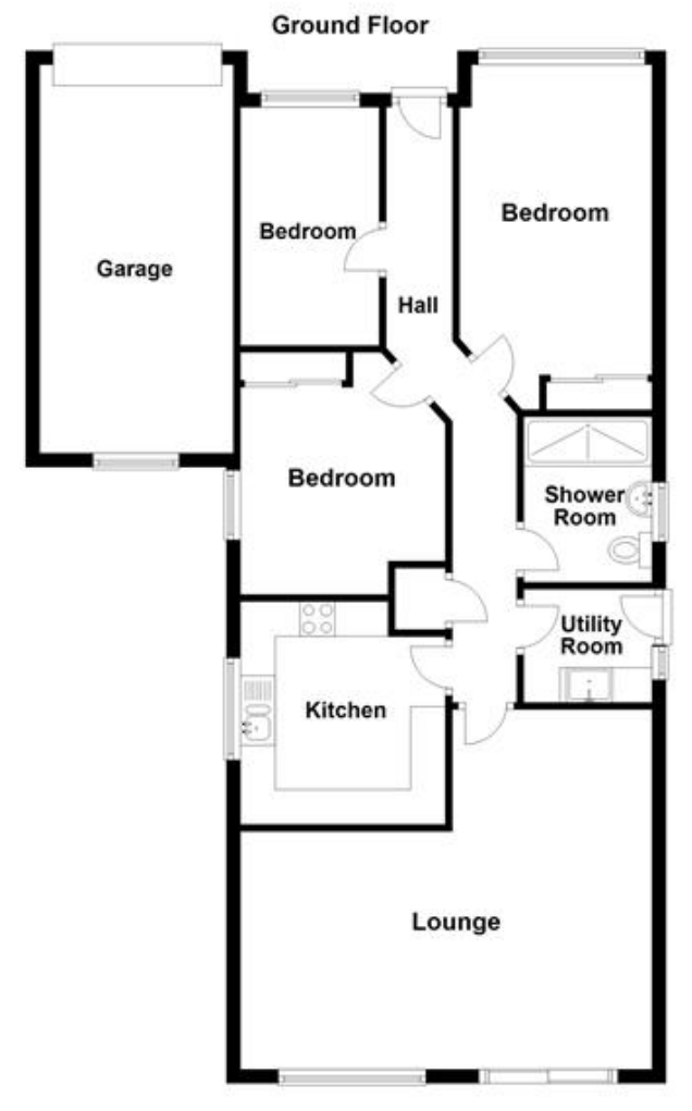
Total area: approx. 99.5 sq. metres (1071.2 sq. feet)