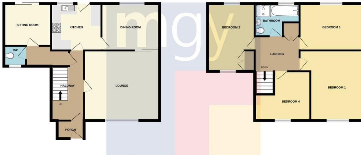
TOTAL FLOOR AREA: 1354 sq.ft. (125.8 sq.m.) approx.

Whilst every attempt has been made to ensure the accuracy of the floorplan contained here, measurements of doors, windows, rooms and any other items are approximate and no responsibility is taken for any error, omission or mis-statement. This plan is for illustrative purposes only and should be used as such by any prospective purchaser. The services, systems and appliances shown have not been tested and no guarantee as to their operability or efficiency can be given. Made with Metropix ©2024