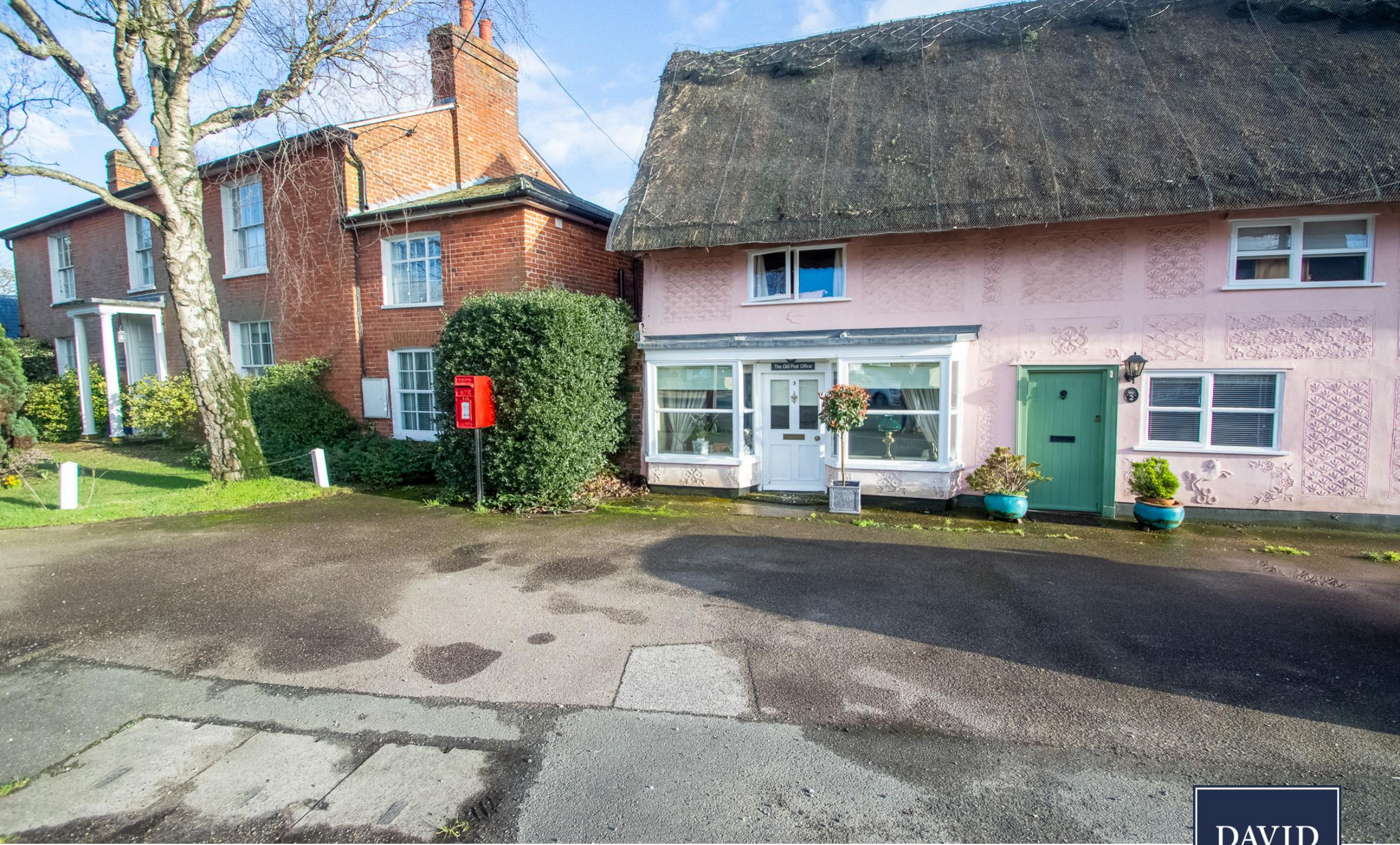
The Old Post Office The Street, Stoke By Clare, Suffolk