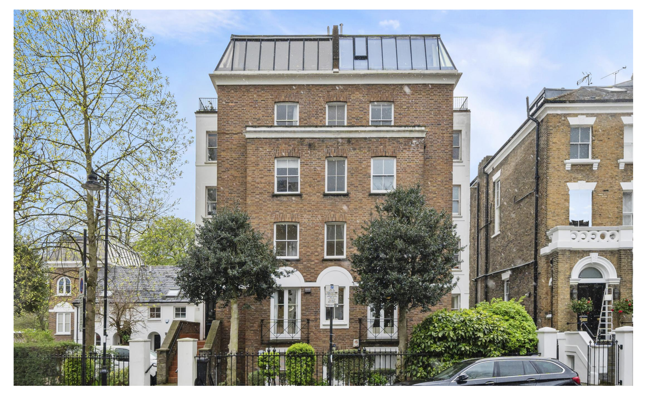
Highbury Hill, N5 1BA