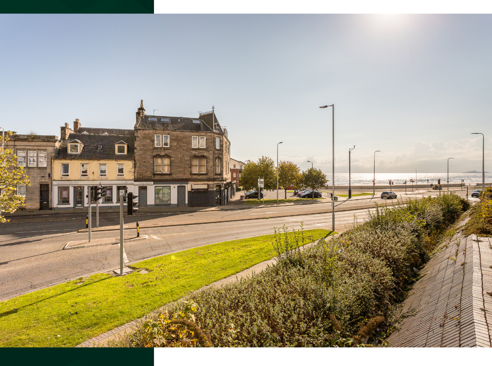
EXCELLENT THREE BEDROOM HOME FOR SALE