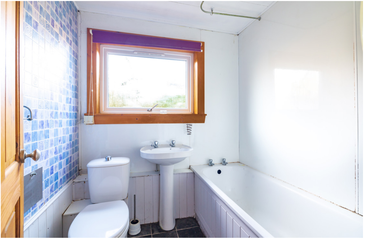
The bathroom includes a full bath suite with an overhead shower, combining convenience with practicality.