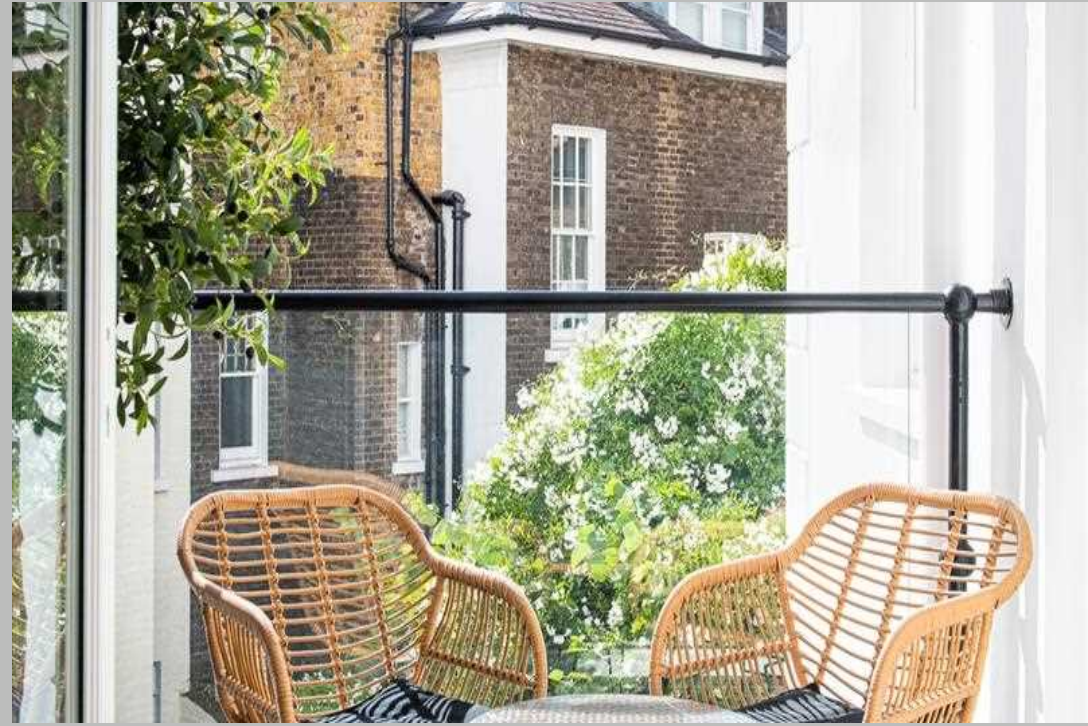
An exquisite two-bedroom apartment situated within an elegant Victorian building in the heart of Kensington.