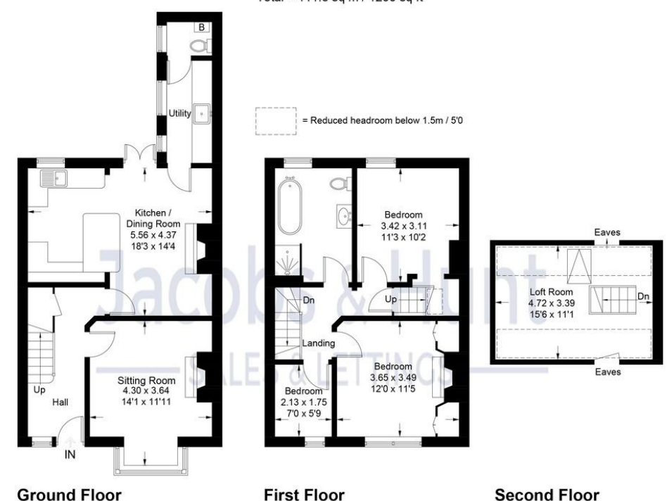
Illustration for identification purposes only,

measurements are approximate, not to scale. (ID750683)