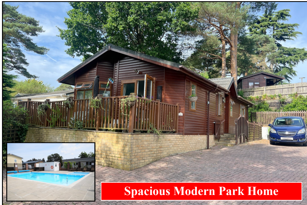
Spacious Modern Park Home

26 Tall Trees Park, Matchams Lane, Christchurch, Dorset. BH23 6TT