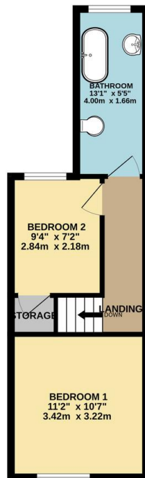
TOTAL FLOOR AREA : 660 sq.ft. (61.3 sq.m.) approx.

Whilst every attempt has been made to ensure the accuracy of the floorplan contained here, measurements of doors, windows, rooms and any other items are approximate and no responsibility is taken for any error, omission or mis-statement. This plan is for illustrative purposes only and should be used as such by any prospective purchaser. The services, systems and appliances shown have not been tested and no guarantee as to their operability or efficiency can be given. Made with Metropix ©2025