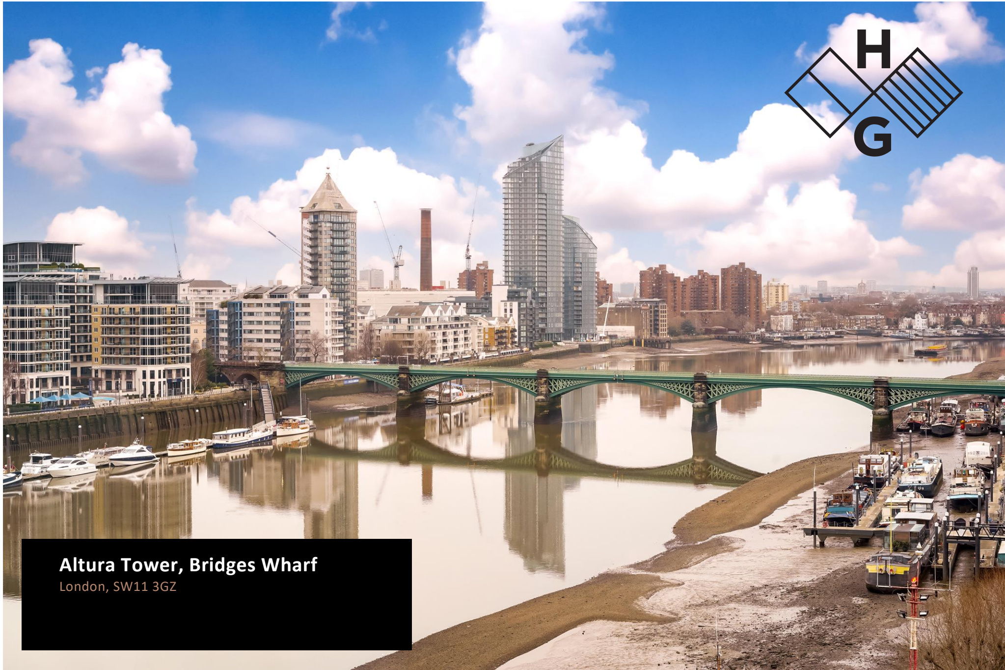
Altura Tower, Bridges Wharf London, SW11 3GZ