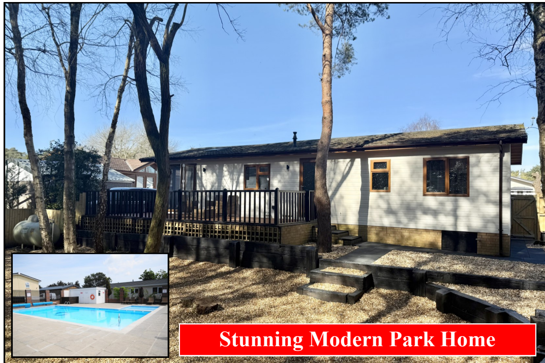
Stunning Modern Park Home

45 Tall Trees Park, Matchams Lane, Christchurch, Dorset. BH23 6TT