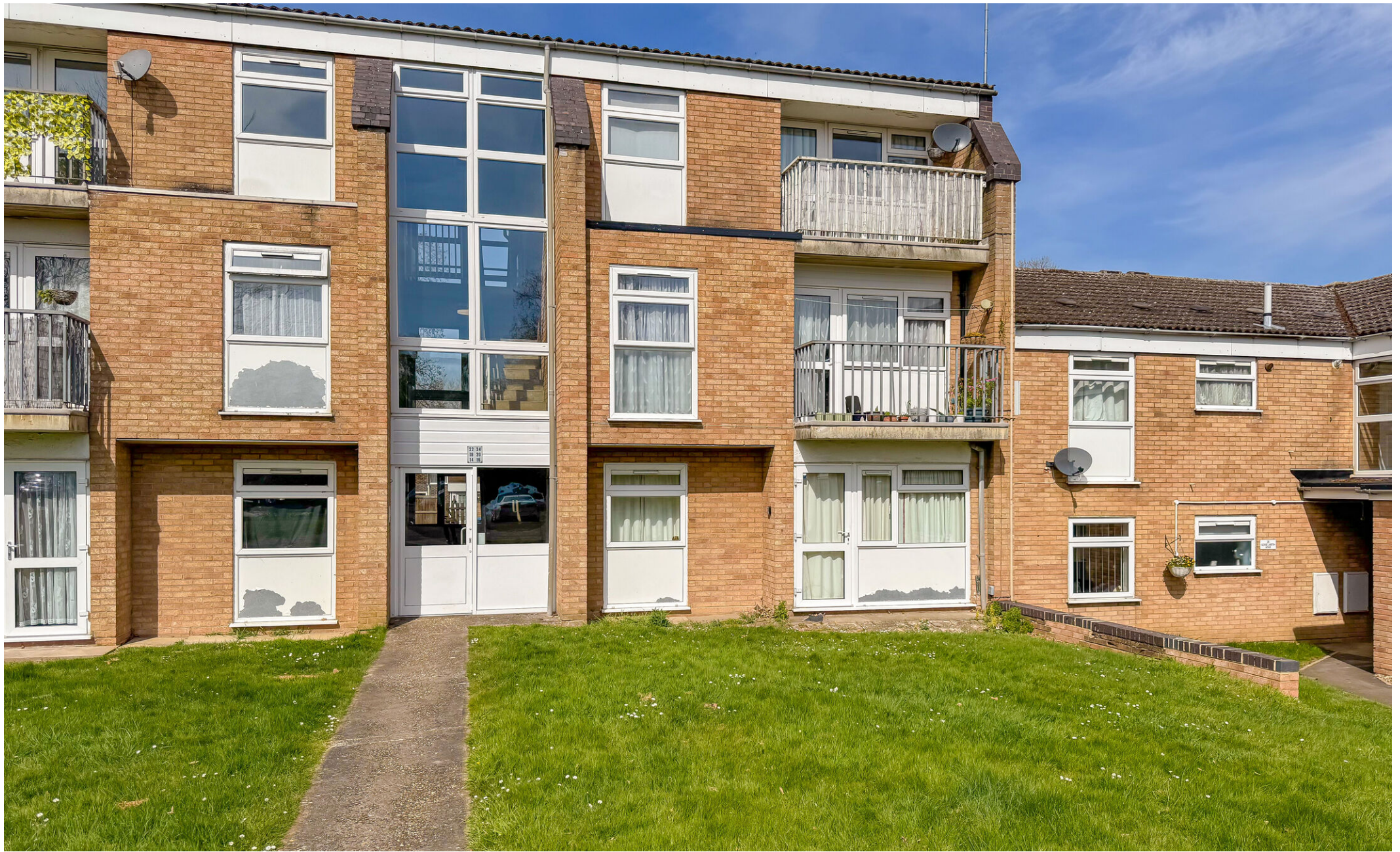
24 George Lambton Avenue