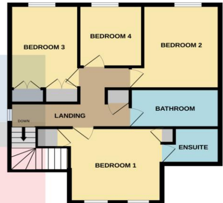
1ST FLOOR 626 sq.ft. (58.1 sq.m.) approx.