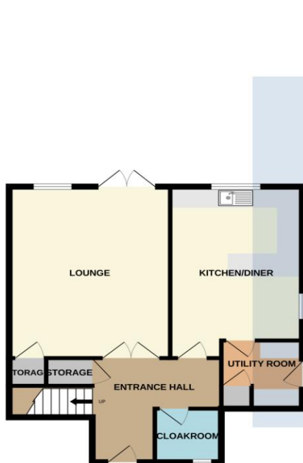
GROUND FLOOR 843 sq.ft. (78.4 sq.m.) approx.