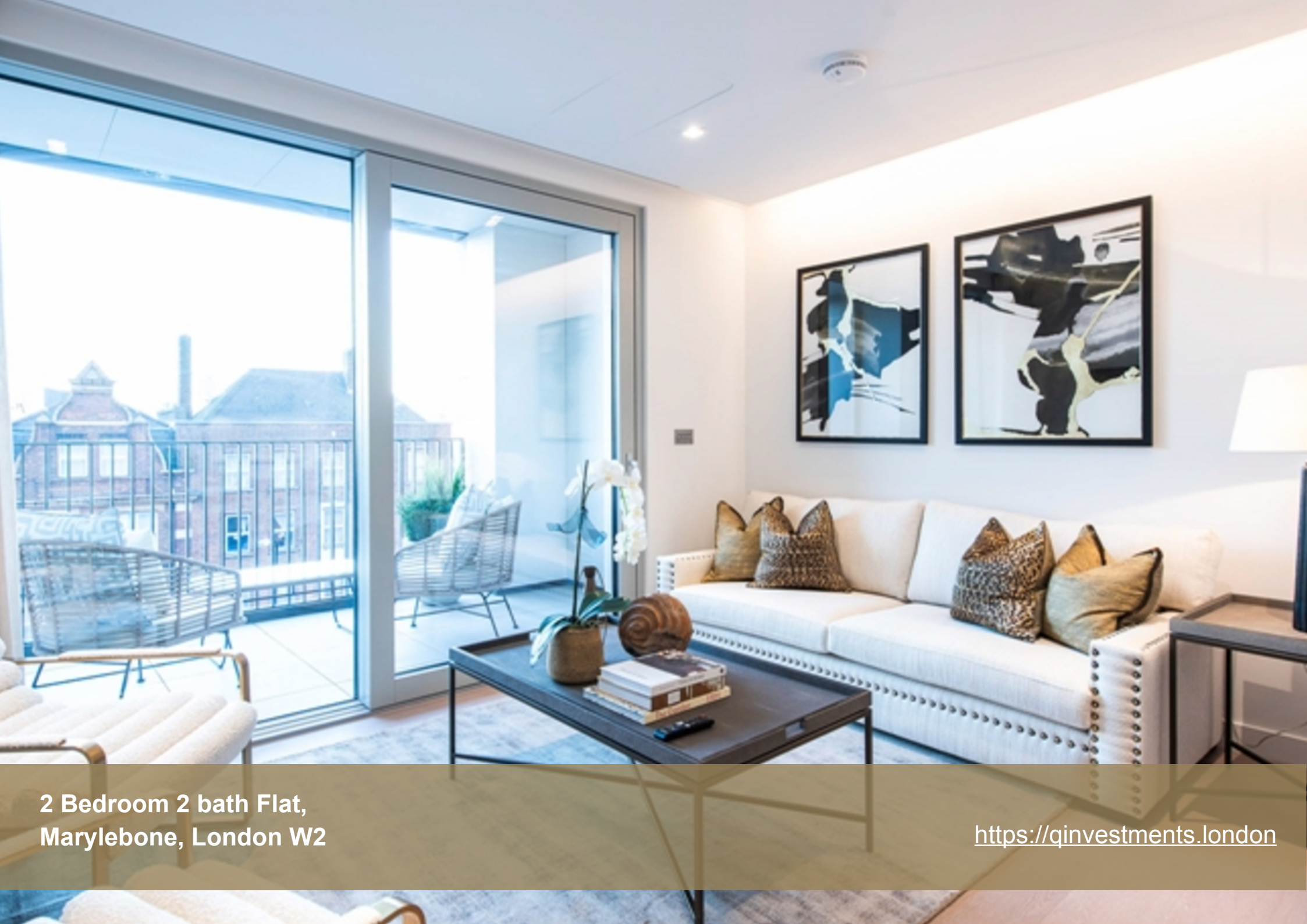
2 Bedroom 2 bath Flat, Marylebone, London W2