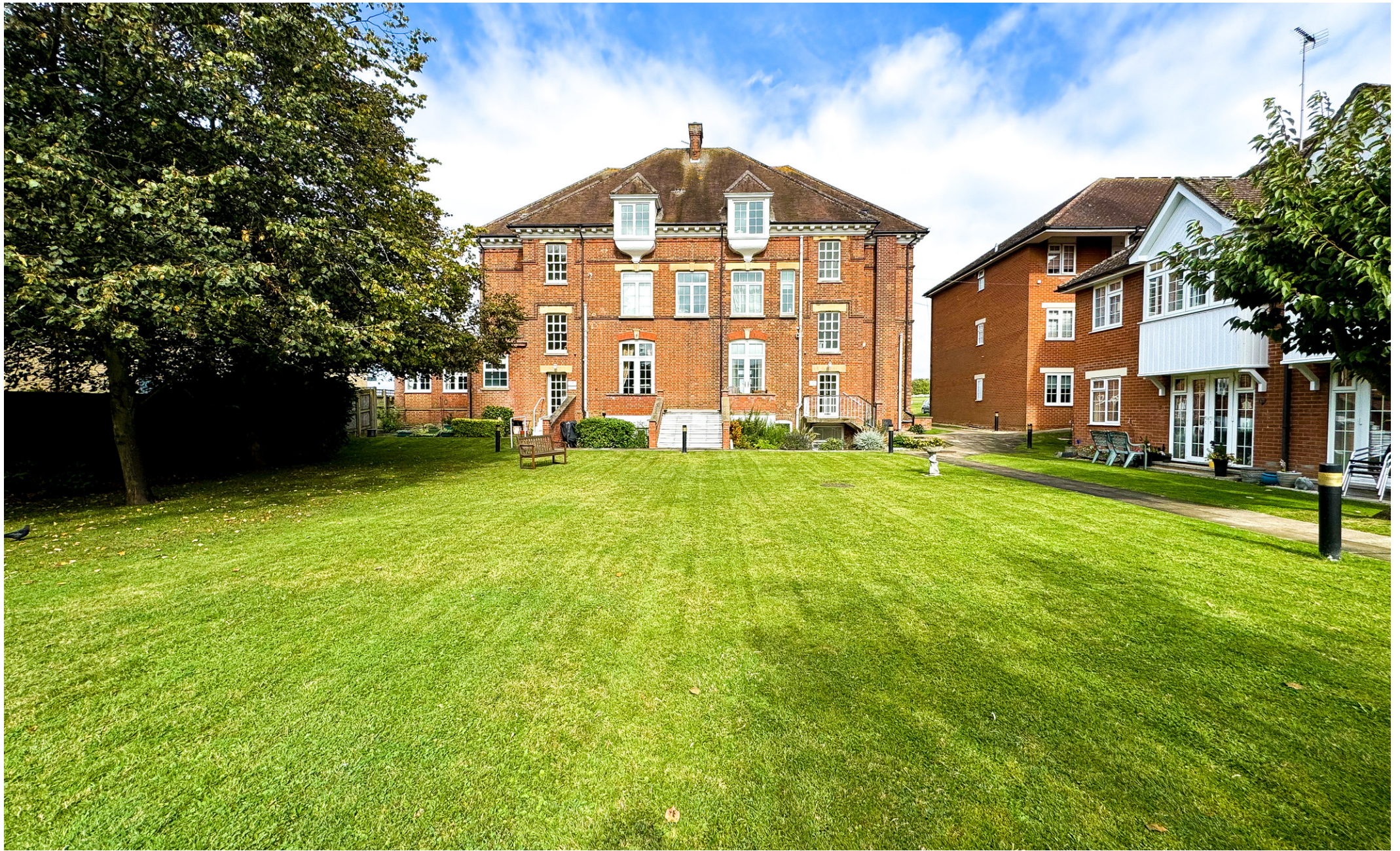
Hillside, Heath Road, Newmarket, Suffolk