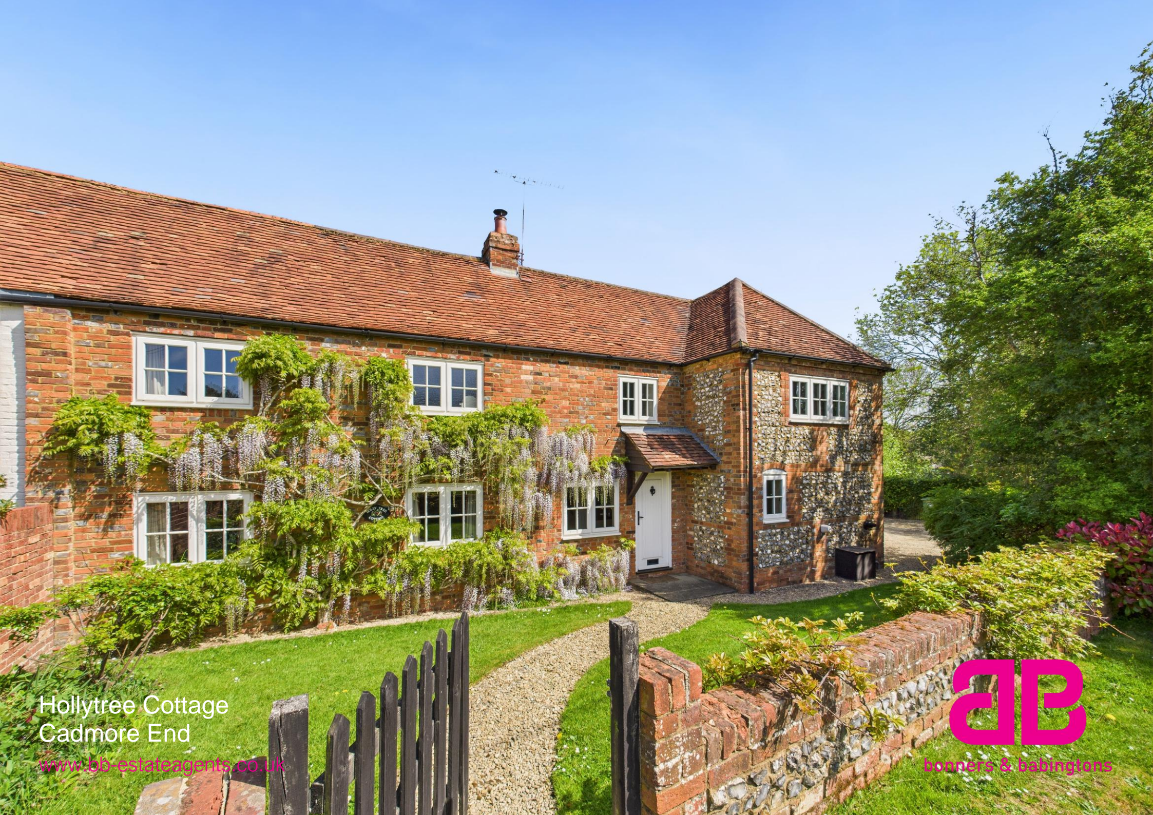
Hollytree Cottage Cadmore End