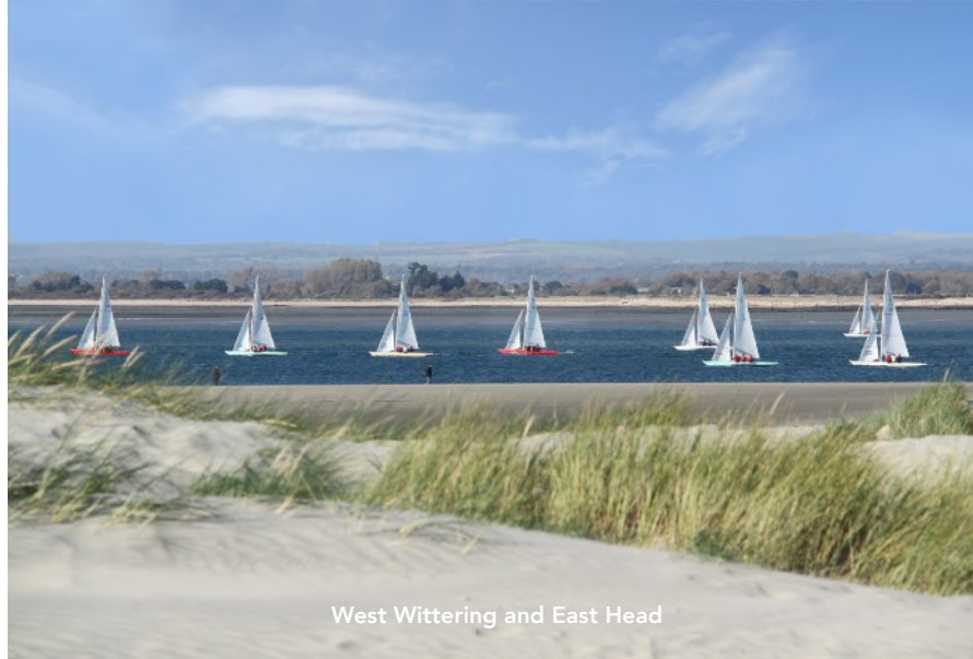
West Wittering and East Head