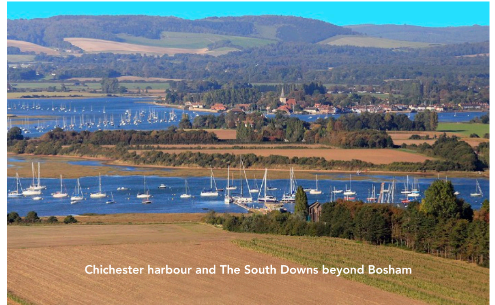
Chichester harbour and The South Downs beyond Bosham