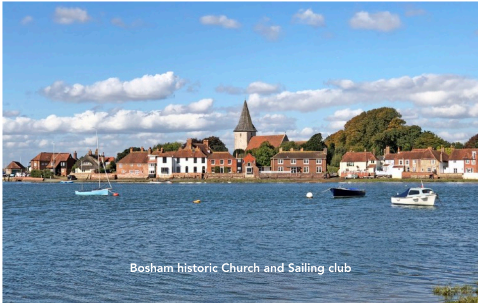
Bosham historic Church and Sailing club

Anchorwyke is a charming detached cottage of character with versatile well proportioned accommodation comprising: 4 bedrooms with 2 bathrooms and a triple aspect sitting/dining room set in delightful well established gardens and grounds, with a garage, well located in the heart of this highly sought after sailing village with lovely walks from the doorstep leading to the harbour and sailing club.