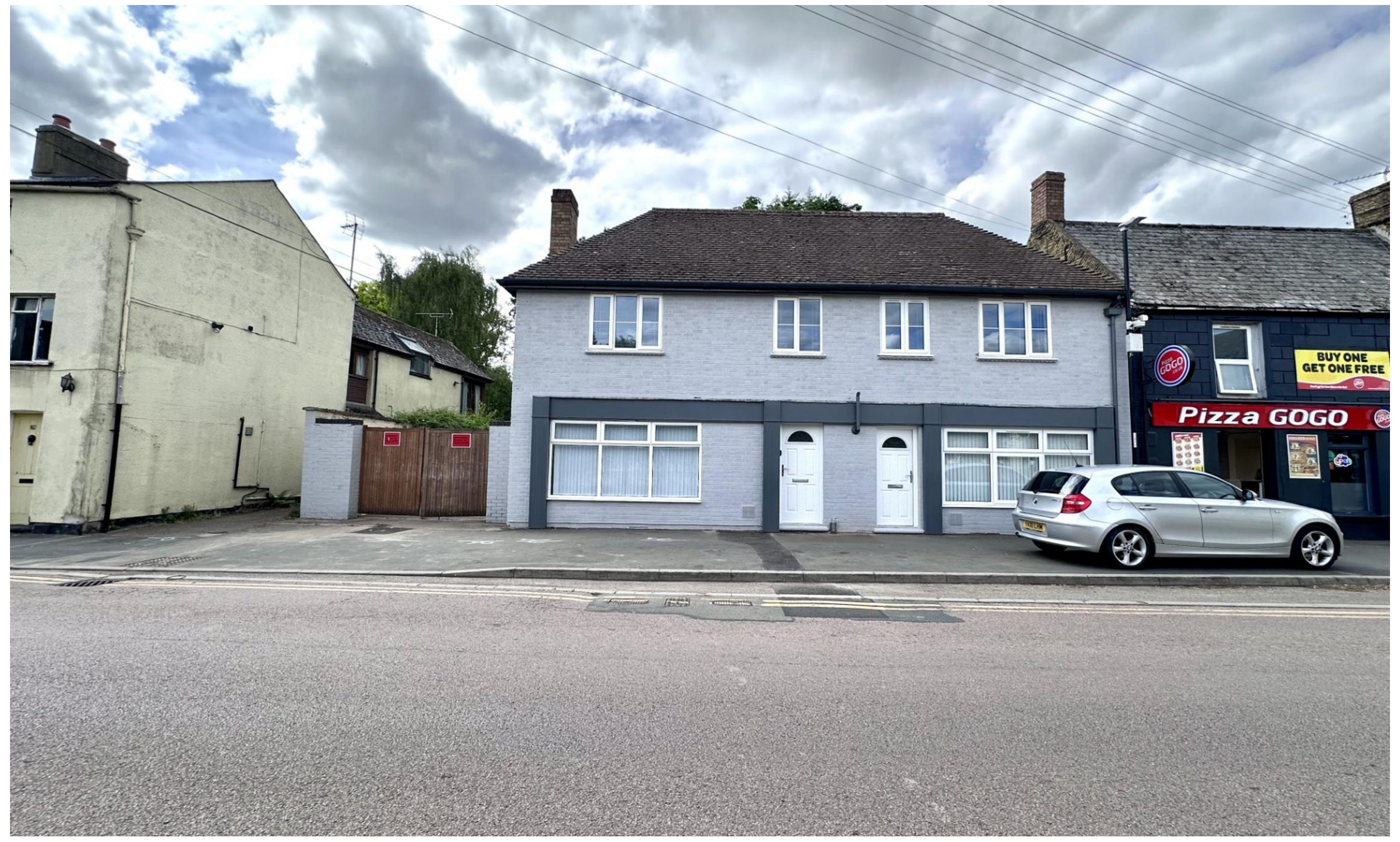
Broad Street, Ely, Cambs CB7 4BE