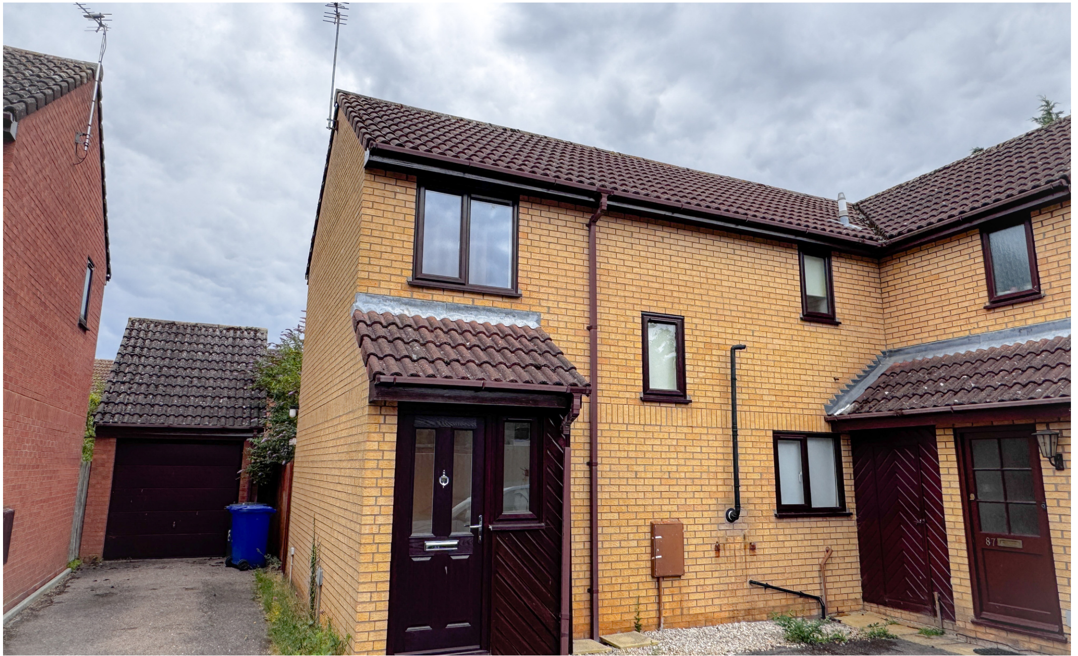
Bill Rickaby Drive, Newmarket, Suffolk