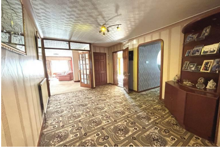
Main Inner Hallway