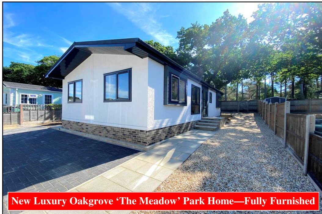
New Luxury Oakgrove 'The Meadow' Park Home—Fully Furnished

67 The Avenue, Oaktree Park, St Leonards, Ringwood. BH24 2RJ