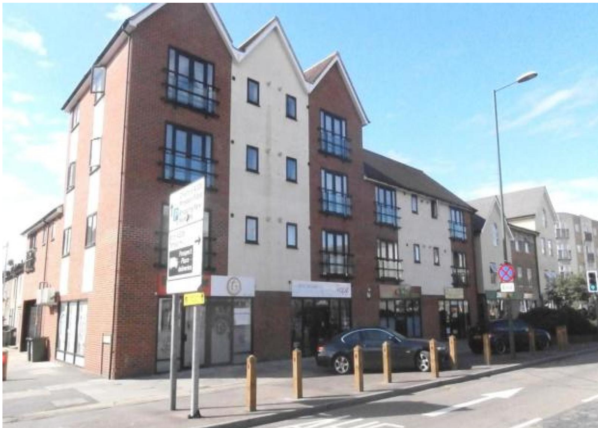
Apple Court, Home Gardens, Dartford £150,000