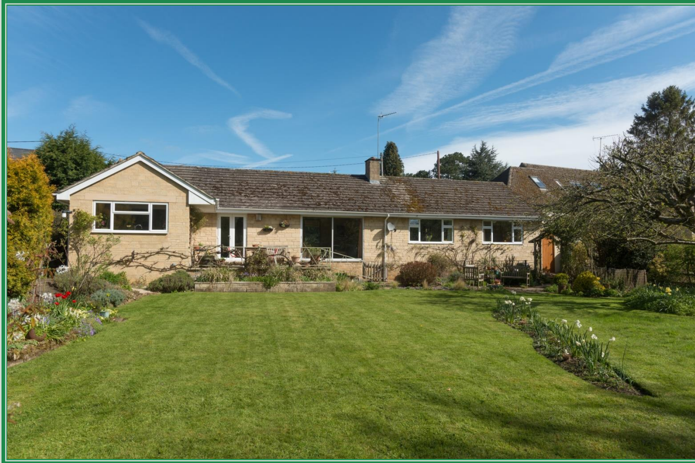
Middle Barton, Oxfordshire