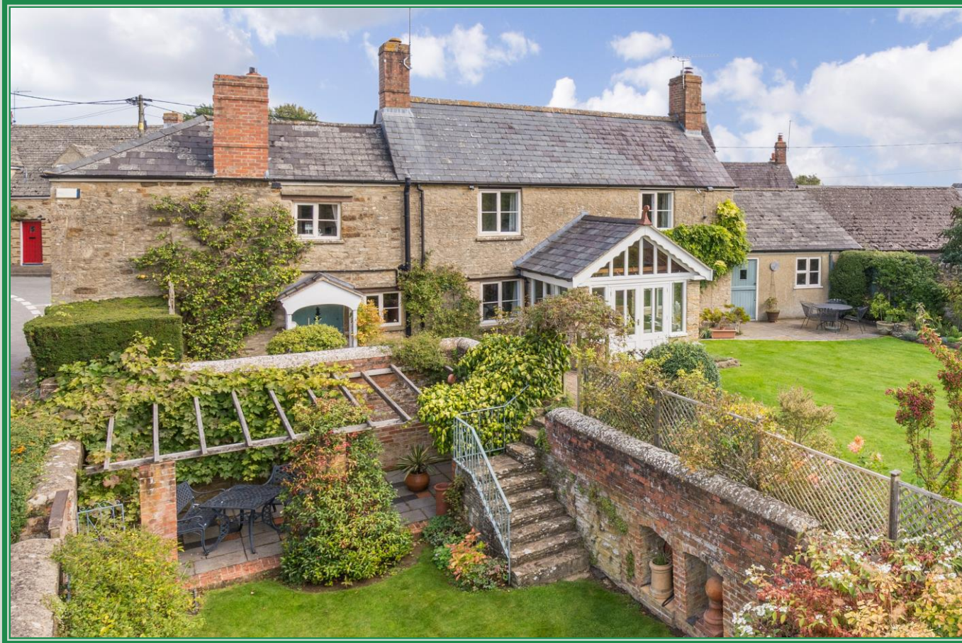
Steeple Aston Oxfordshire