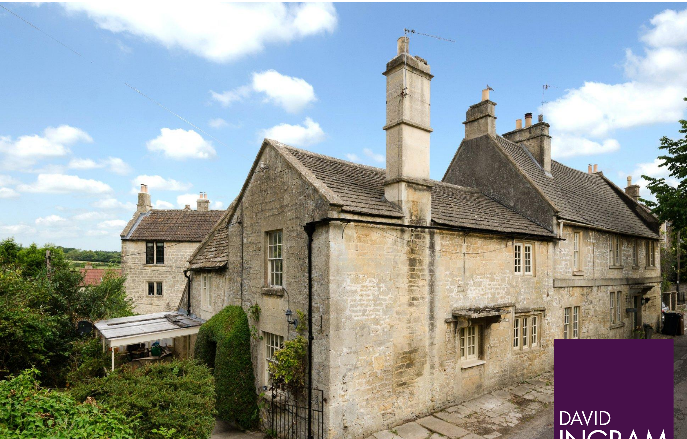
2 Townsend, The Ley, Box, Corsham, SN13 8JU