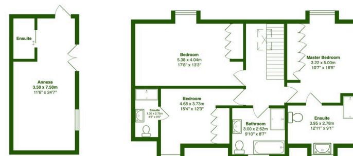
Total Area: 286.9 m 2 ... 3088 ft 2 All measurements are approximate and for display purposes only