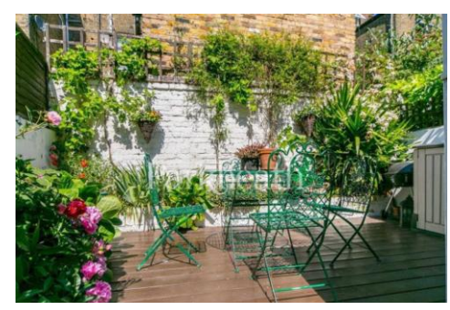
Ponsard Road, London W10 £1,000,000 Freehold

Mile are delighted to bring to market this competitively priced family home, situated on this quiet residential road on Kensal Green. This property has been well maintained throughout by the current owner. Taking shape on the ground floor of an incredible double 24ft reception room with bay windows, from the reception via beautiful siding doors greets the bright fully fitted contemporary kitchen diner. Also on the ground floor houses the charming bathroom as typical for Victorian properties. Via the kitchen also gives access to the peace private garden. The first floor benefits from three double bedrooms and an additional WC. The attic has been cleverly converted to house an additional bedroom and great bathroom. Offered in good condition the home benefits from double glazed windows, wooden flooring & carpet throughout, high ceilings and an abundance of light and storage space. Ponsard Road is within easy reach of Kensal Green and Willesden Junction (Bakerloo line and Overground) and Kensal Rise (Overland) stations as well as the numerous coffee shops, restaurants, gastro pubs and shopping amenities of Park Parade, Kensal Rise/Green, Ladbroke Grove and Notting Hill. The property falls within the catchment of multiple desirable school catchment areas.