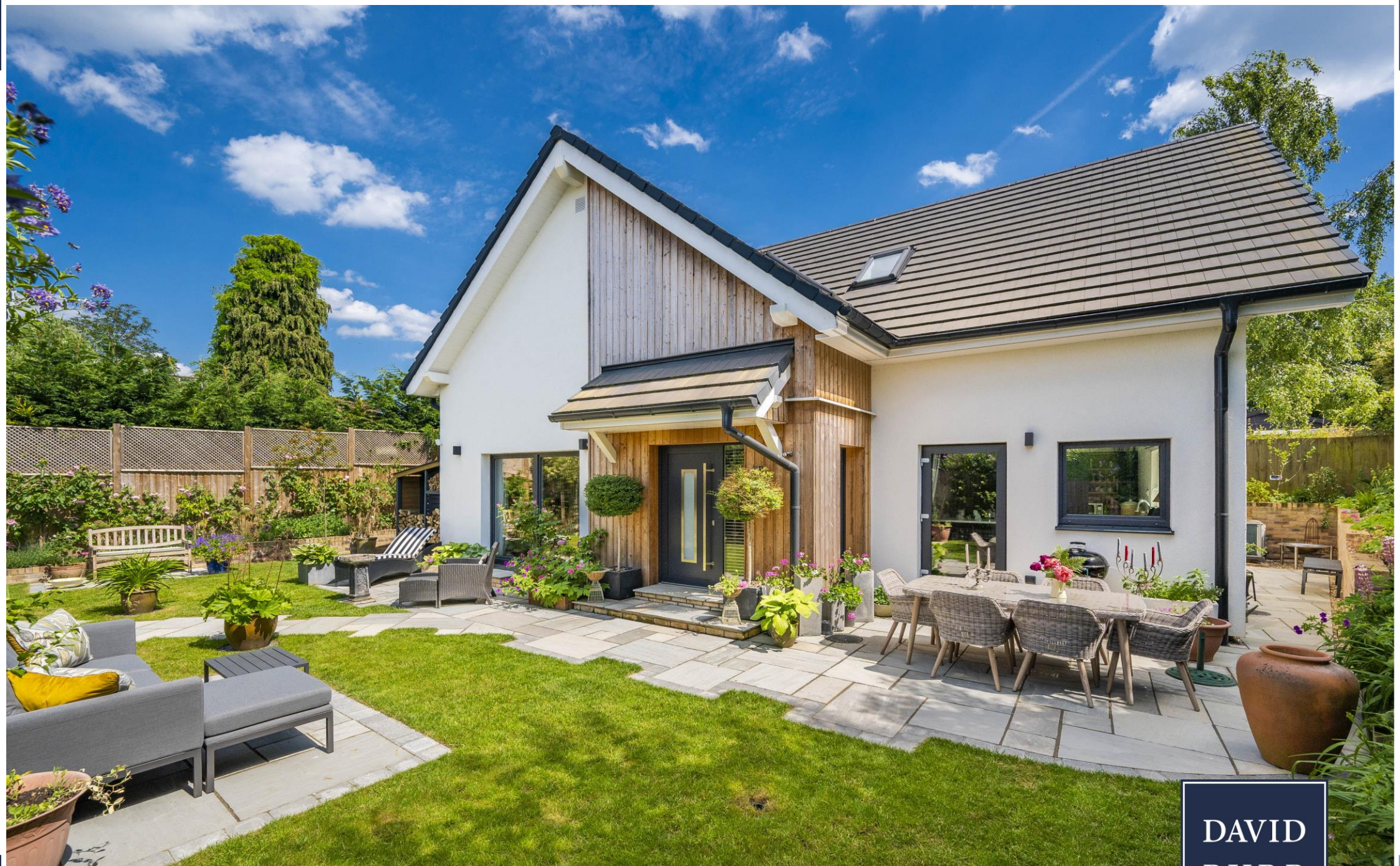
Tawny House, Drinkstone Green, Suffolk.