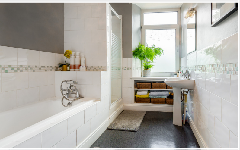
First Floor Bathroom