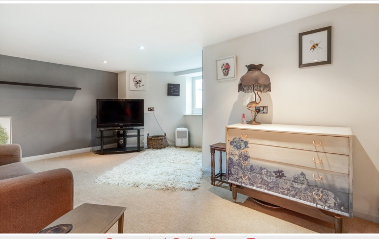
Converted Cellar Room Two