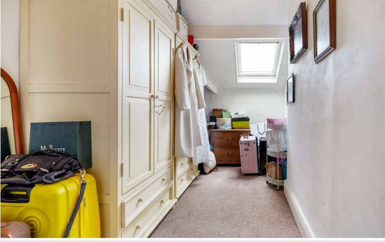
Bedroom Four/Home Study